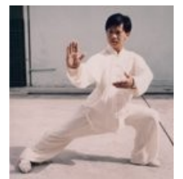
Transitioning to Right Separation Kick