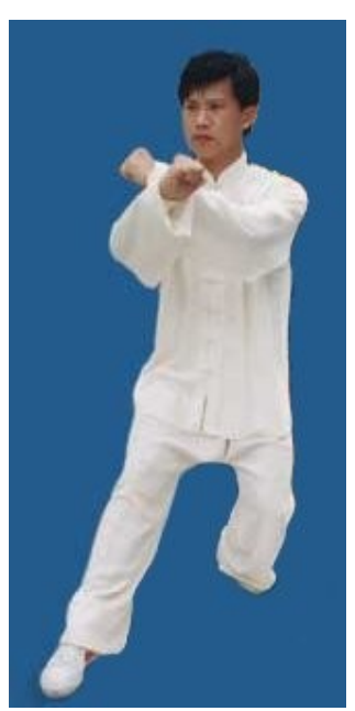
Step Forward Seven Stars

"As long as you settle the qi in the dantian and your heart is calm, then your practice is natural and calm. That is enough. This is easier to learn and easier to practice for everyone. You loosen the entire body, coordinate all the movements in the joints so that your four limbs are dependent on the movement of the waist, and you use the waist like the universal joint of a car. When the waist leads the movement, the waist will engage the movement of the abdomen.