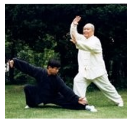
Snake Creeps Down, and Fair Lady Works at Shuttles

"Qi is energy traveling throughout the body. For example, generally speaking, the qi unites and coordinates with the internal force, jin. We know that after you exercise you experience greater circulation of blood and energy. What makes circulation move? There is some force, some energy behind this circulation."